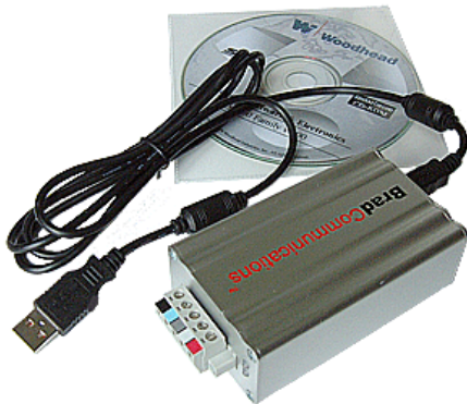
High Speed USB v2.0 Adapter Development Kit